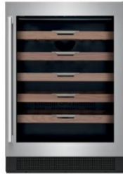
EI24WC15VS Wine Cooler