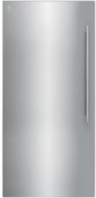
EI33AF80WS Single Door Freezer