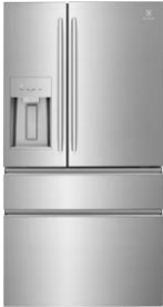
ERM2295AS French Door Refrigerator