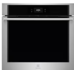
ECWS3012AS Wall Oven