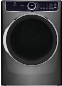
ELFE7637AT 600 Series Electric Dryer