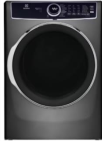
ELFE4222AW 24" Compact Dryer