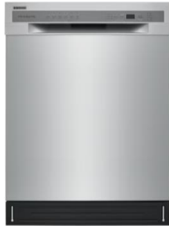
FFBD2420US Stainless Steel Dishwasher