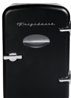
EFMIS129-BLACK Retro Mini Fridge